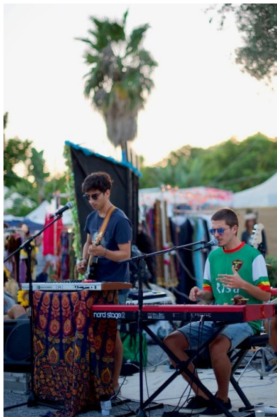
Las Dalias – Ibiza

Facebook: https://www.facebook.com/bliazemusic