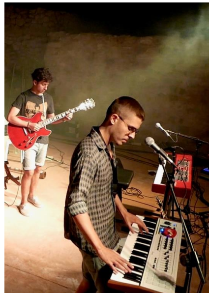
Dalt Vila Castle – Ibiza